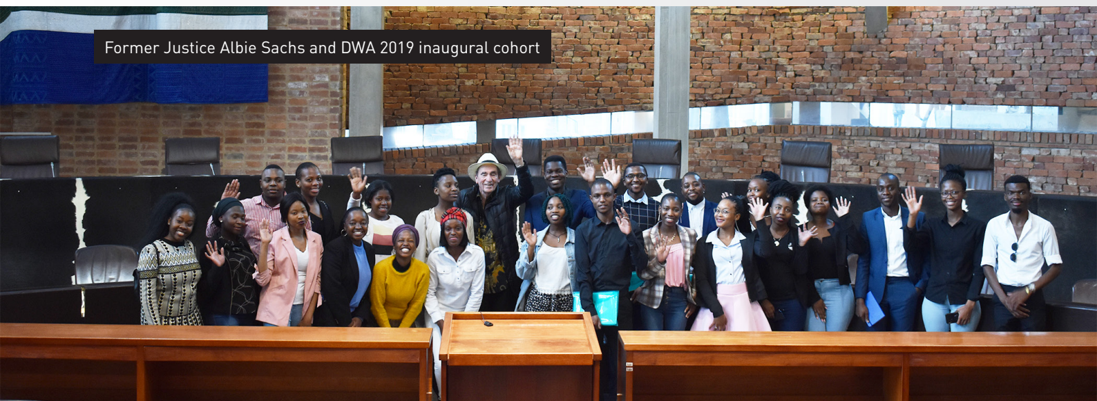
Former Justice Albie Sachs and DWA 2019 inaugural cohort

For this Residential Seminar, we intend to equip the Fellows with practical skills they can use as tools to help uplift their communities and build resilient democracies. These tools will include proposal writing, events planning, financial management, social media management, writing a curriculum vitae and cover letter, and site visits of civil society organisations in our network.